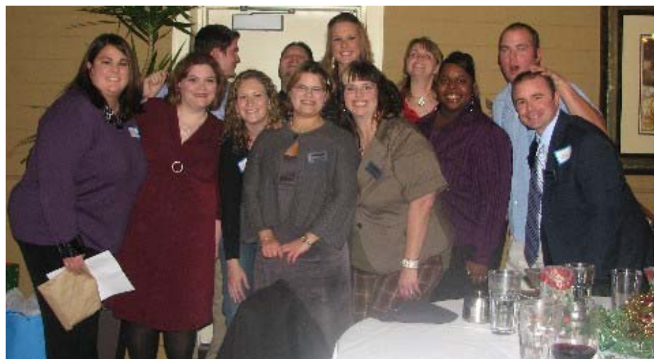
The 2008 board poses after being sworn in at 2007 Christmas Party/Installation Banquet at the Riverstation

Distinguished Service Awards- The date of the DSA is January 29th not the January 28th as mentioned in the December newsletter.