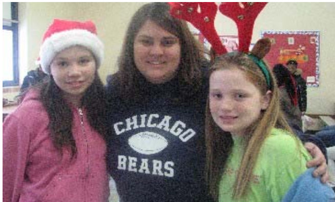
El Presidente poses with two kids from Calvin Coolidge