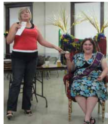
Roxy getting a little payback