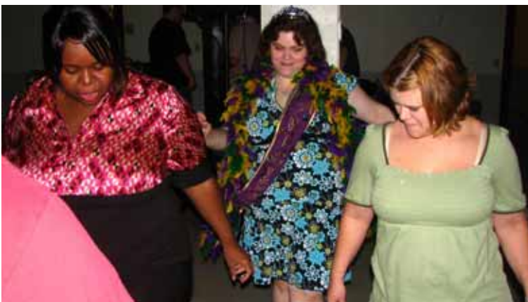
Some Jaycees Dancing