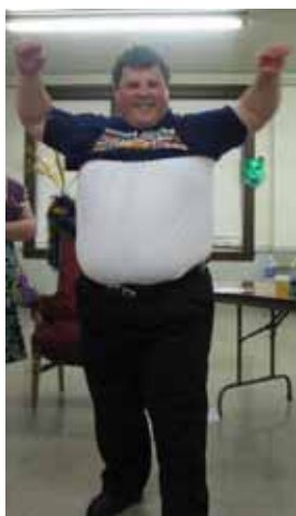
Fat guy in a little frozen T-shirt