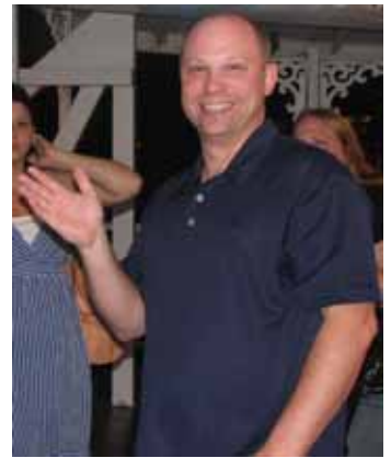
Tim's going to Subway later to get a $5 footlong