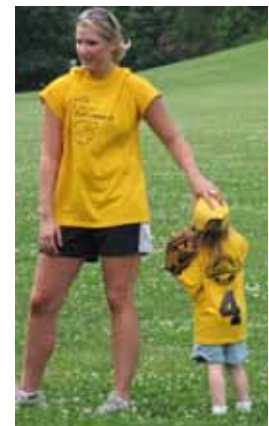
I'll make sure your hat does not blow off again