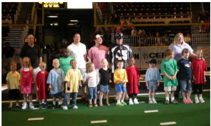
Several T-ballers and coaches enjoyed a Pirates game courtesy of the team