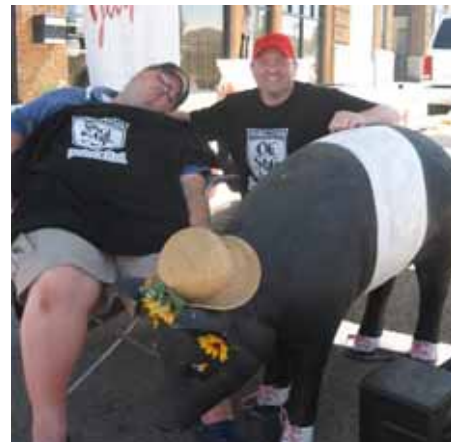
The secret to the team's success - Bring your own pig.