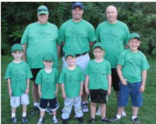
The Mean Green Machine