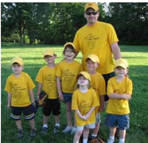
The Mello Yellow Team