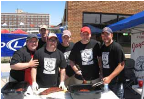
There's the 3rd place team in action