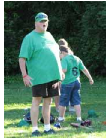
She was safe ump