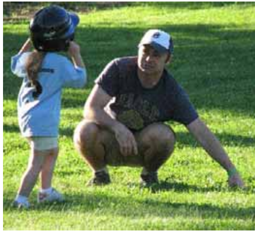
Watch out for the dog poop here