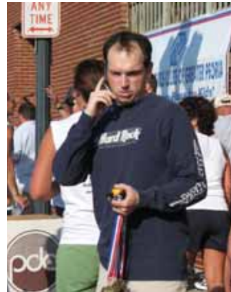
I can't hear you now