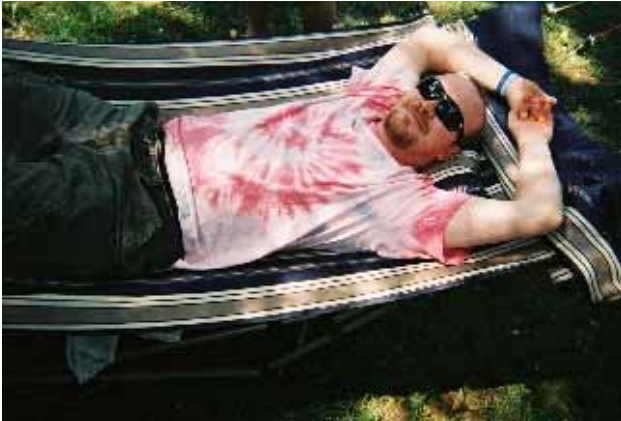
Camping wears me out