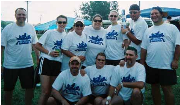
The before picture of Bitter's Ritches