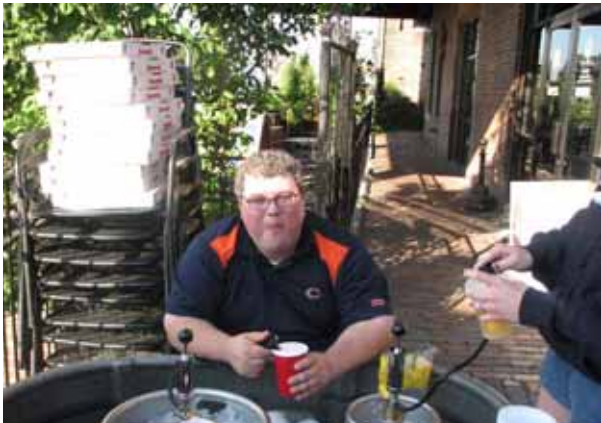
MMMM Pizza and Beer or The fox guards the hen house