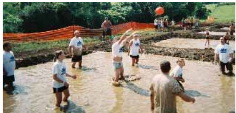
The team demonstrating the skill that led to a 2-2 record