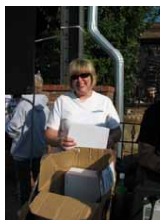
Is it bigger than a bread box?