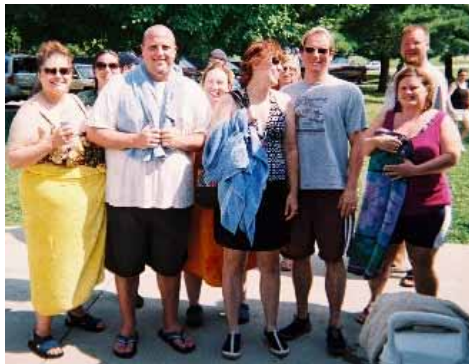
A bunch of Jaycees getting ready to swim