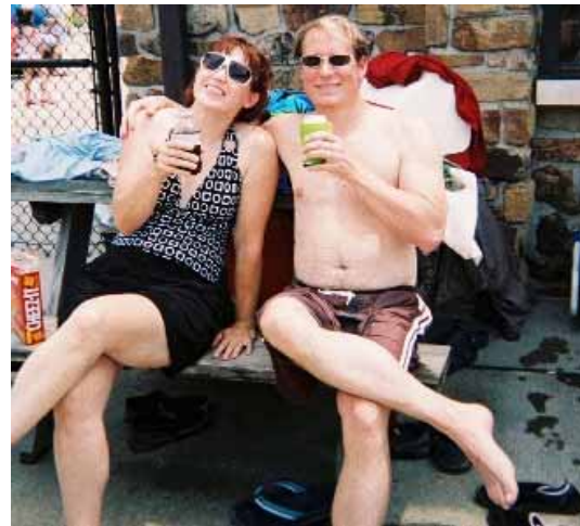
That SPF 1,000 really works great