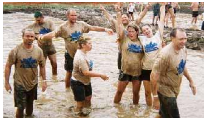
The thrill of victory