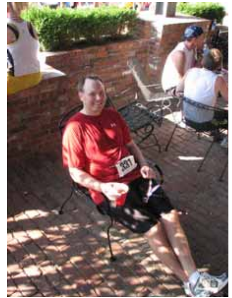
You sure that was only 5k It felt like 3 miles