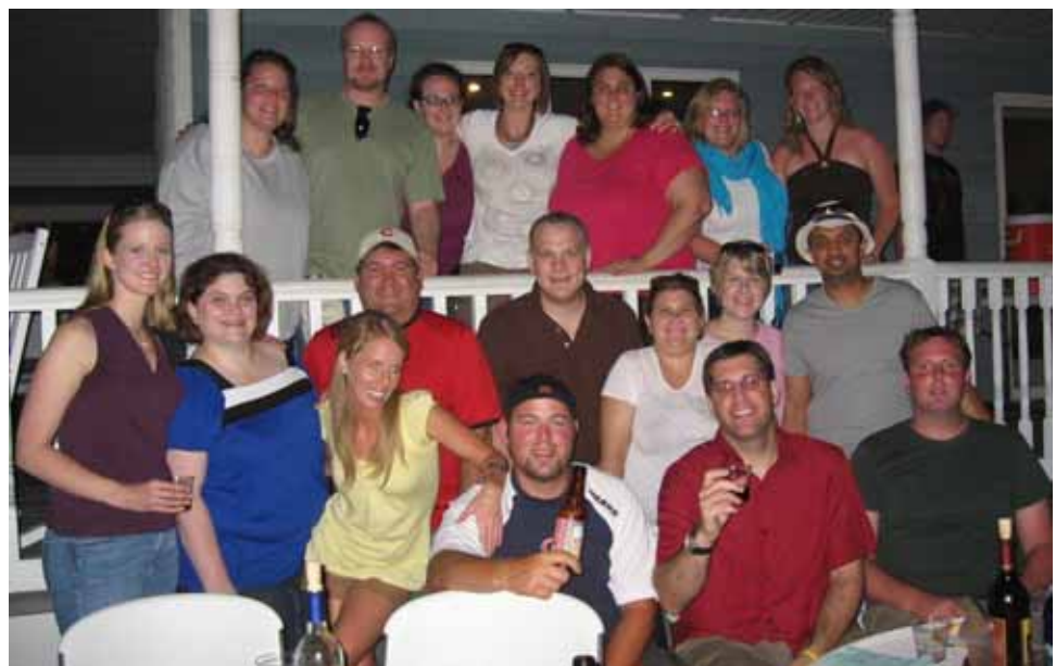
Peoria and Bloomington-Normal members relax at the Mackinaw Winery Social

Night Golf is September 20. Entry forms can be downloaded at jaycees.com